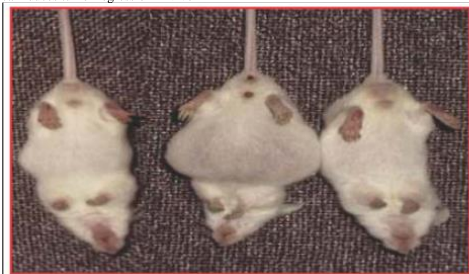
Figure 2: Calcaria carbonica induces tumor regression in vivo

Calcaria carbonica induces tumor regression in vivo