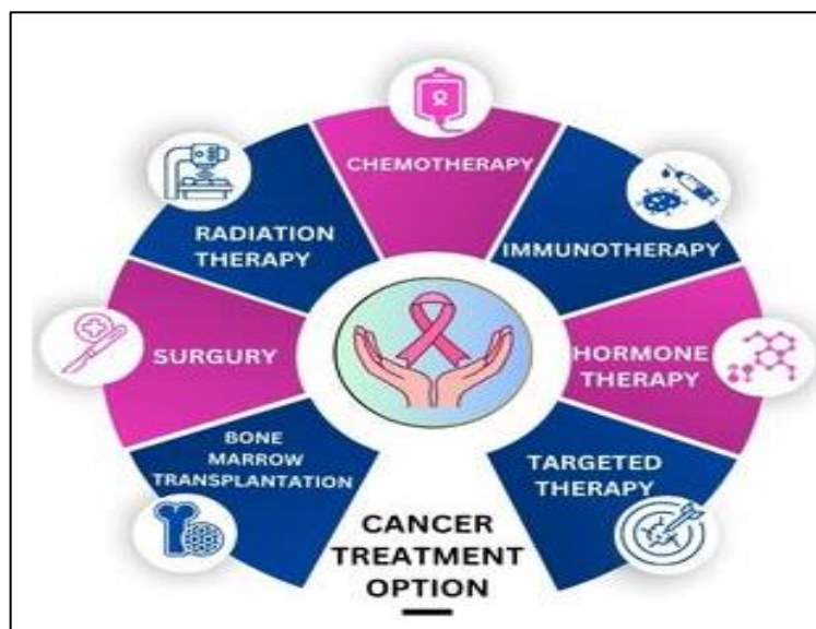
Figure 1: Conventional Treatments

For cancer patients, standard treatments include radiotherapy, chemotherapy, surgery, and oral medicines. These medications have a number of adverse effects. In such circumstances, the immune system is already compromised. [21] Sometimes the patient is unable to handle consistent medication administration. These are the standard methods, however in order to lessen your suffering, we also recommend that you consider a homeopathic cancer treatment. [22]