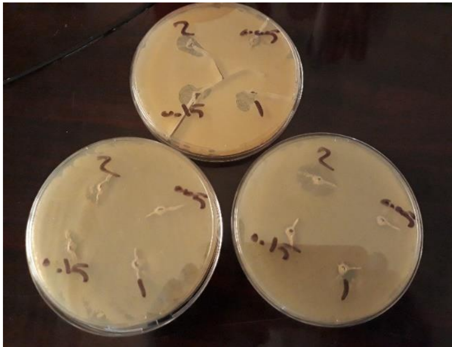
Picture (1): Examination of sensitivity to sesevium plant extract by drilling method shows the inhibitory effect on salmonella bacteria on the culture media.